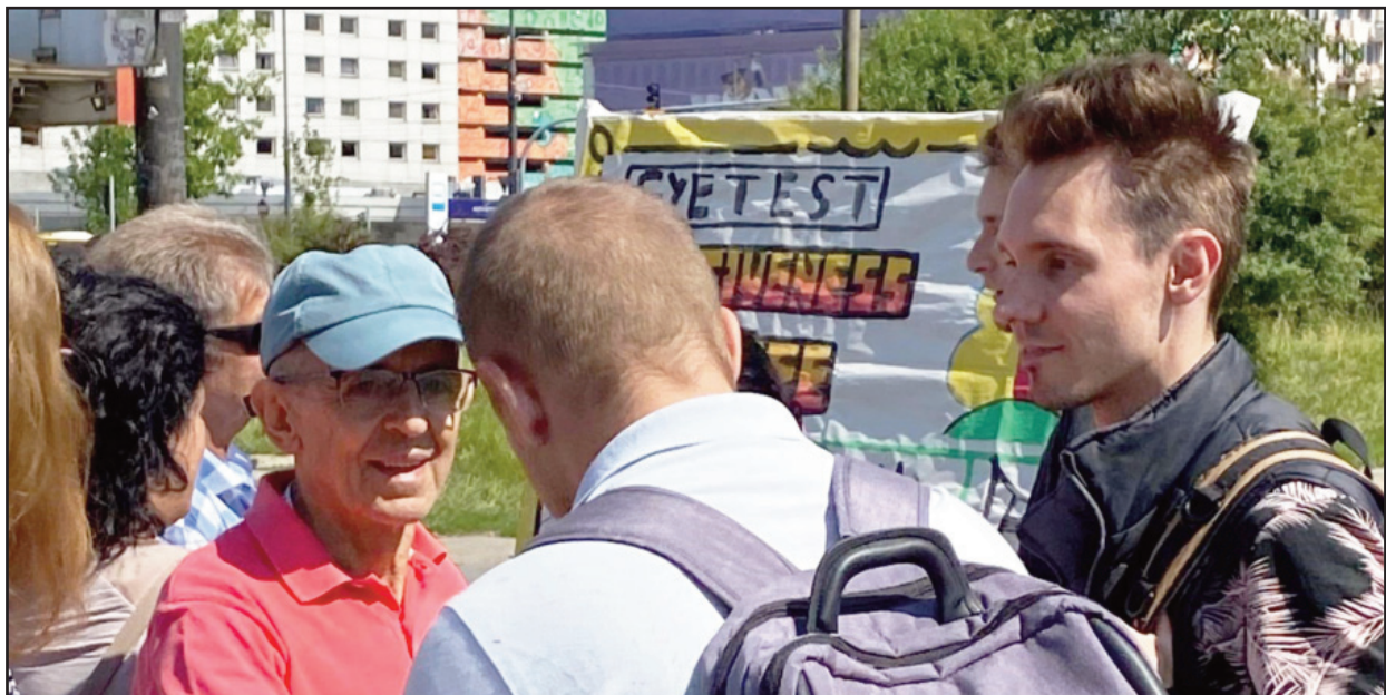
CONVERSATIONS TAKING PLACE AFTER A SKETCHBOARD PRESENTATION IN WARSAW