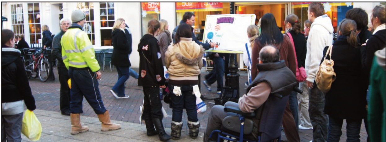
BUSY SIDEWALKS PROVIDE A VARIETY OF OPPORTUNITIES WHERE THE GOSPEL CAN BE PROCLAIMED