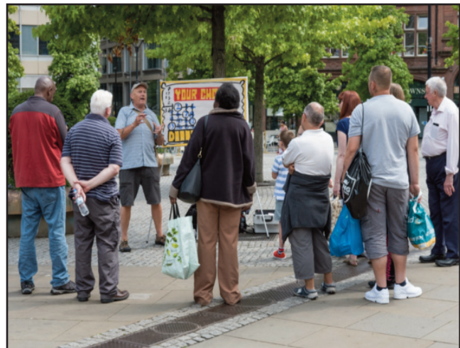
CITY PARKS ARE A GREAT PLACE TO SHARE CHRIST