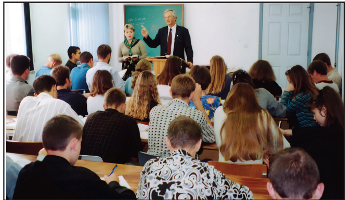
KIEV CHRISTIAN UNIVERSITY SEMINAR

In 1999, I arrived in Kiev and was met by some of the KCU staff. They took me on a tour that I shall never forget. As we went through the World War II museum, we saw hundreds of photos of the eight million Ukrainians who had been killed in various ways. Our translator wept. Then, we went to a Jewish memorial that showed hundreds of families being mowed down by Nazi machine guns, as the parents tried to shield their children with their bodies. In the forest, we were shown black crosses made like crows (a