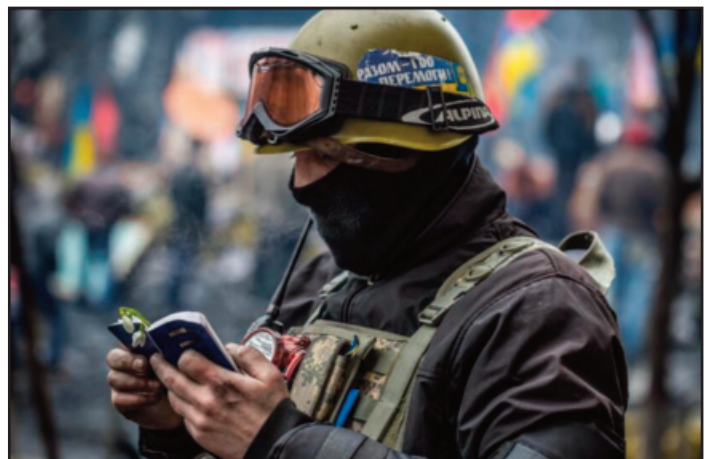
SOLDIER FACING DEATH READING SCRIPTURE