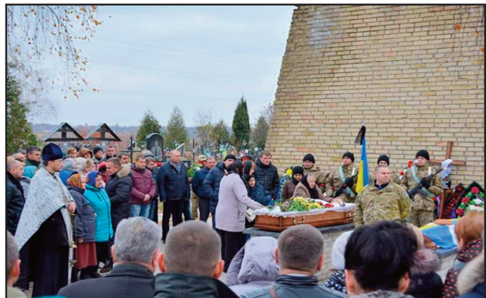
PARTICIPATING IN FUNERALS