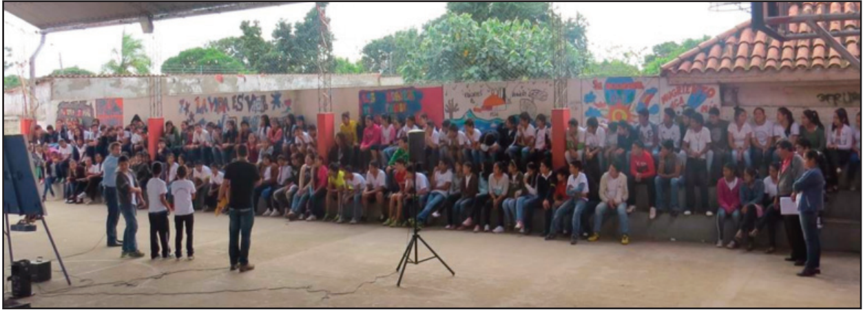
PUBLIC SCHOOL ASSEMBLY