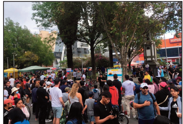
RENE PREACHING IN RIO BAMBA