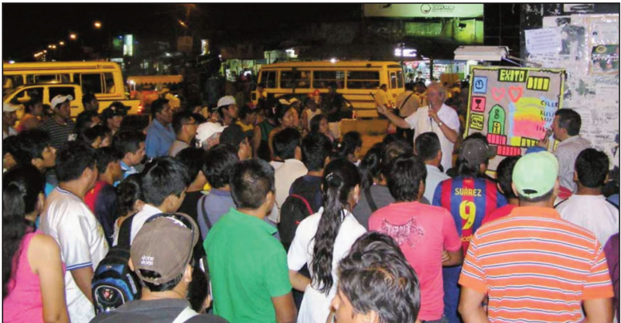
OPEN HEARTS LISTENING TO THE GOOD NEWS OF SALVATION