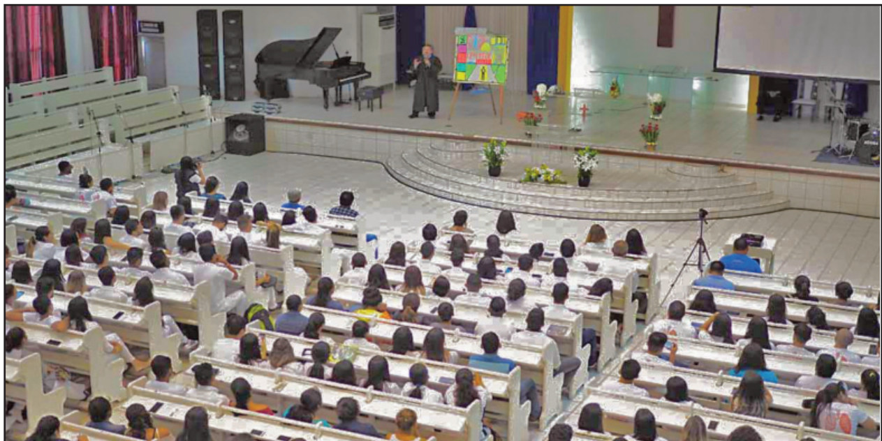
MEDICAL UNIVERSITY STUDENTS HEAR THE GOSPEL MESSAGE