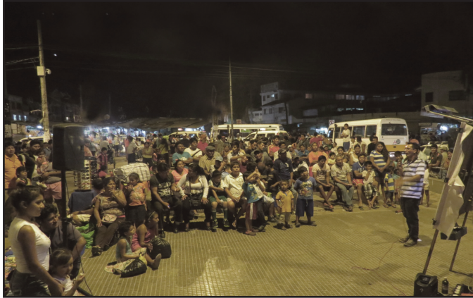
OPEN-AIR MEETING IN SANTA CRUZ