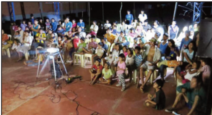
YUQUIS TRIBE'S PEOPLE WATCH THE FILM ON JESUS