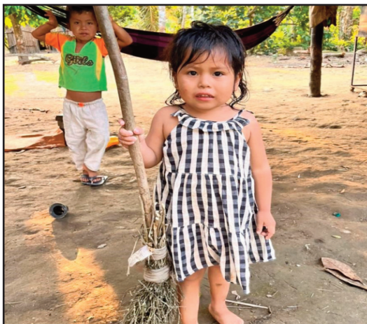
AN INDIAN GIRL FOR WHOM CHRIST DIED