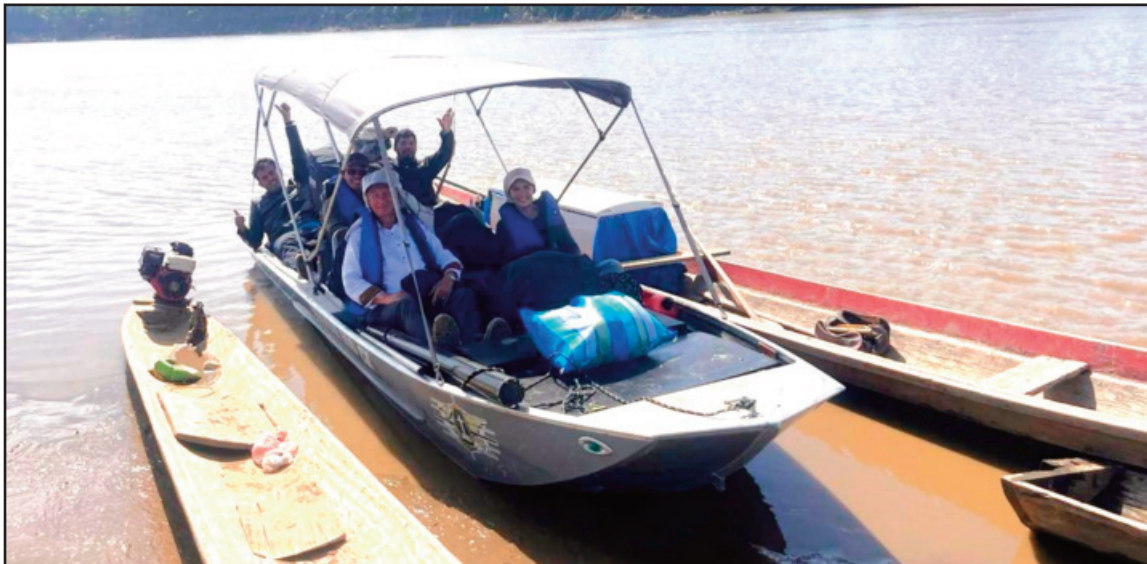
OAC BOAT FOR REACHING INTERIOR INDIAN TRIBES

In order to reach Indian tribes where there are no roads, OAC Bolivia now has a boat! A team goes out for 10 days, taking everything needed, including tents, food, water, film equipment, generator, electric fence to protect them from jaguars, plenty of gas, and an Indian guide. Each day they reach another village, show The Jesus Film, and preach a black light message. The response is tremendous. Some chiefs say to please send a pastor and they will build a church. This is happening! Some told us, "You are the first missionaries to ever visit our tribe."