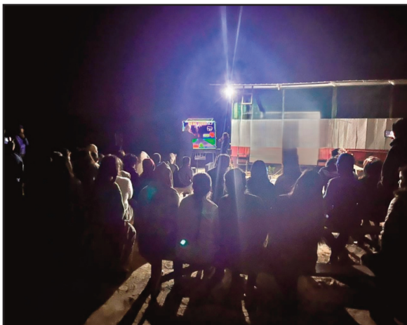
AN INDIAN TRIBE HEARING THE GOSPEL