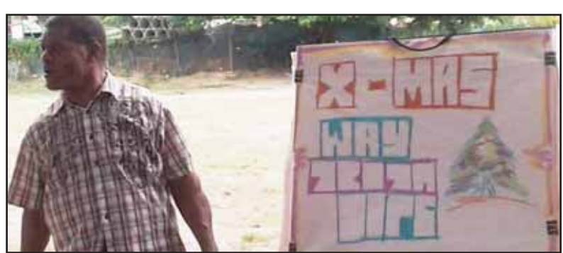
SAMU PROCLAIMING CHRIST USING THE SKETCHBOARD