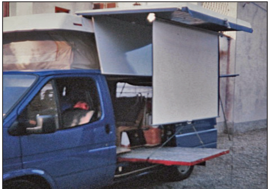
23 - NEWLY EQUIPPED FORD TRANSIT

In 1986, we had a newly equipped Ford Transit (picture 23). As long as our children were small, they could sleep on the bed in the back of the van while traveling. I had designed the canopy, which was manufactured in Eastern Europe. It was made of carbon, the lightest and strongest material in existence at the time, used to construct airplanes. A special financial gift from the US made all this possible, and it was an excellent tool of evangelism! The van was equipped so that a blacklight board message could be prepared while the movie was playing. Then, with the touch of a finger, the screen rolled up in two seconds, after which an "altar-call" could be given, illustrated by the blacklight painting!