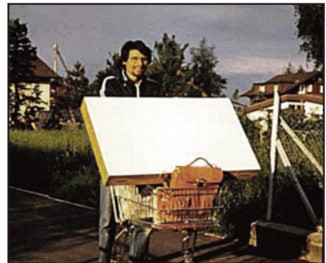
04 - SHOPPING CART TRANSPORT

A fully equipped sketchboard, including legs, paint box, and literature, makes for a hefty bundle, so I fit it with wheels as a base that latches onto the board using flexible cords. These inventions I designed and built were a great help to keep our travel to and from open-air meeting locations easy and efficient.