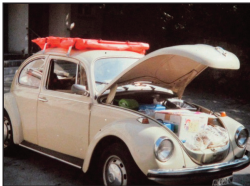
11 - A MINISTRY "BEETLE"