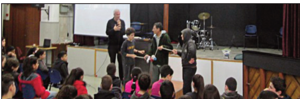
35 - DEVOTIONS WITH OBJECT LESSON AND STUDENT PARTICIPATION

In 2017, my back started "going out" so I began working with a handheld sketchboard (picture 36). I have discovered that most everyone is receptive to interesting pictures illustrating the gospel. Such drawings can easily be displayed on these boards making them especially well suited for smaller meetings.