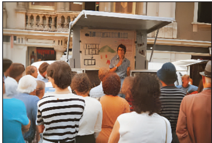
12 - VAN CANOPY IN ACTION

mechanic to fix this problem before we had to drive through the Gotthard tunnel. I believe we surely would have been arrested had this issue not been fixed, as the van sounded like rifle fire as it went down the road!