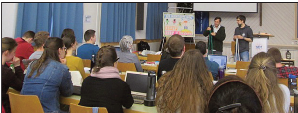
43 - STUDENTS LEARNING "THE ROPES"

Picture 42 shows an open-air meeting in 2019 at Interlaken with Seminary Biblical Theology students. An "international" tourist is filming the action. We are showing students "the ropes" (picture 43) and how to teach with visual aids.