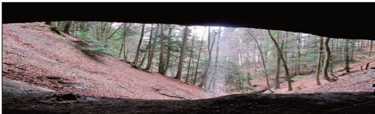
48 - A CAVE IN SWITZERLAND, USED AS A PLACE OF REFUGE BY ANABAPTISTS IN REFORMATION TIMES

So, what is the contraption in picture 47? It's an underground printing press, assembled using washing machine and bicycle parts. This machine was used to produce small Gospels, bound in leather, on water-resistant paper, so that they could be buried in the snow. This moisture-resistant printing process was essential, especially for those sent to labor camps under communist rule.