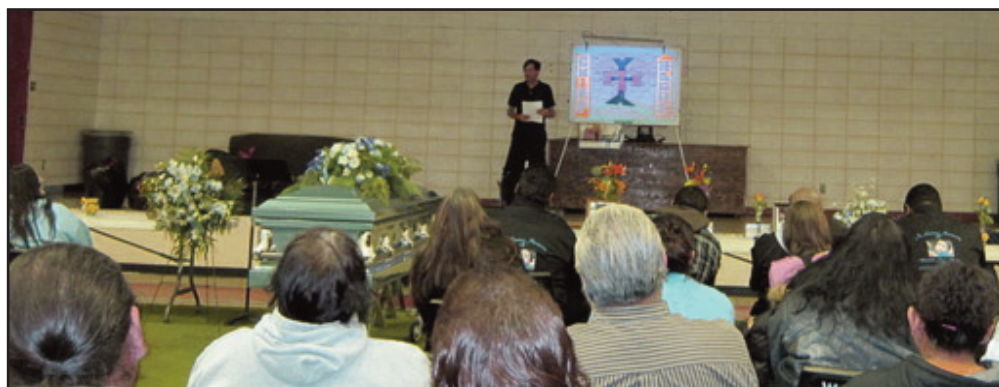
32 - USING THE EAGLE SYMBOL AT A FUNERAL OF A SMALL BOY WHOSE NAME MEANT "CHIEF EAGLE"

In 2012, I used the Eagle as a symbol in my message (picture 32) at the funeral of a little boy whose Indian name was "Chief Eagle!" Using cultural symbols has opened many doors and hearts to the gospel! There is truth in every culture, and those points of truth are great starting points for sharing biblical truth. God does not contradict Himself, so it is possible to point people to Him, no matter what the cultural