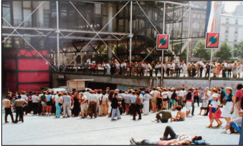
27 - OPEN-AIR IN PARIS

no way to contact him or any of the team members! So, Shoshanah and I prayed for God to guide us. We were driving along and didn't need gas, yet God prompted us to stop at a gas station about 30 miles outside of Milano. When we stopped at the station and asked for directions, there was a Volvo with GB license plates gassing up - it was Korky!!! GPS at that time stood for "God's Positioning System," and God certainly took care of the details, as this story illustrates!