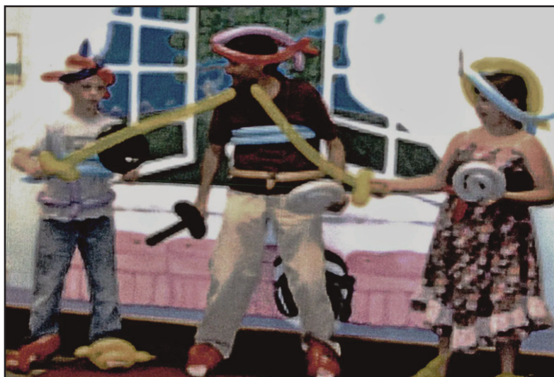
37 - LOCAL LIBRARY EVENT

For many years, I taught "Reasoning with Truth" (Science and Philosophy) at a local college. Through this contact, the local library opened its doors for children's events. One year, a summer vacation class was offered on making balloon sculptures (picture 37). One class illustrated "The Armor of God" presentation based on Ephesians 6. Classes in puppetry and drama were also offered to disabled people.