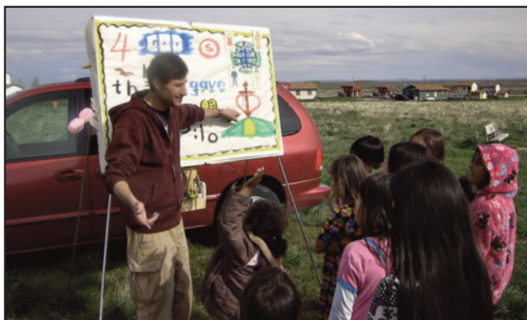
33 - TEAM OR NO TEAM, THE MINISTRY CONTINUES