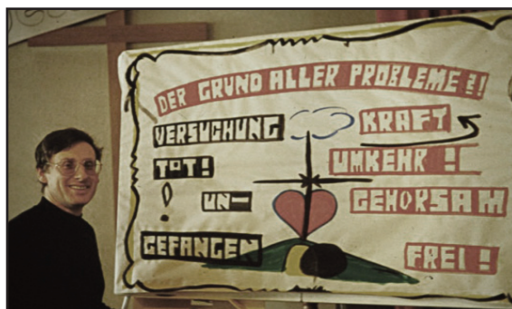
17 - ONE OF THE FIRST OAC SWITZERLAND SEMINARS