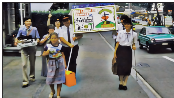
18 - MOVING THE SKETCHBOARD CLOSER TO THE CROWD