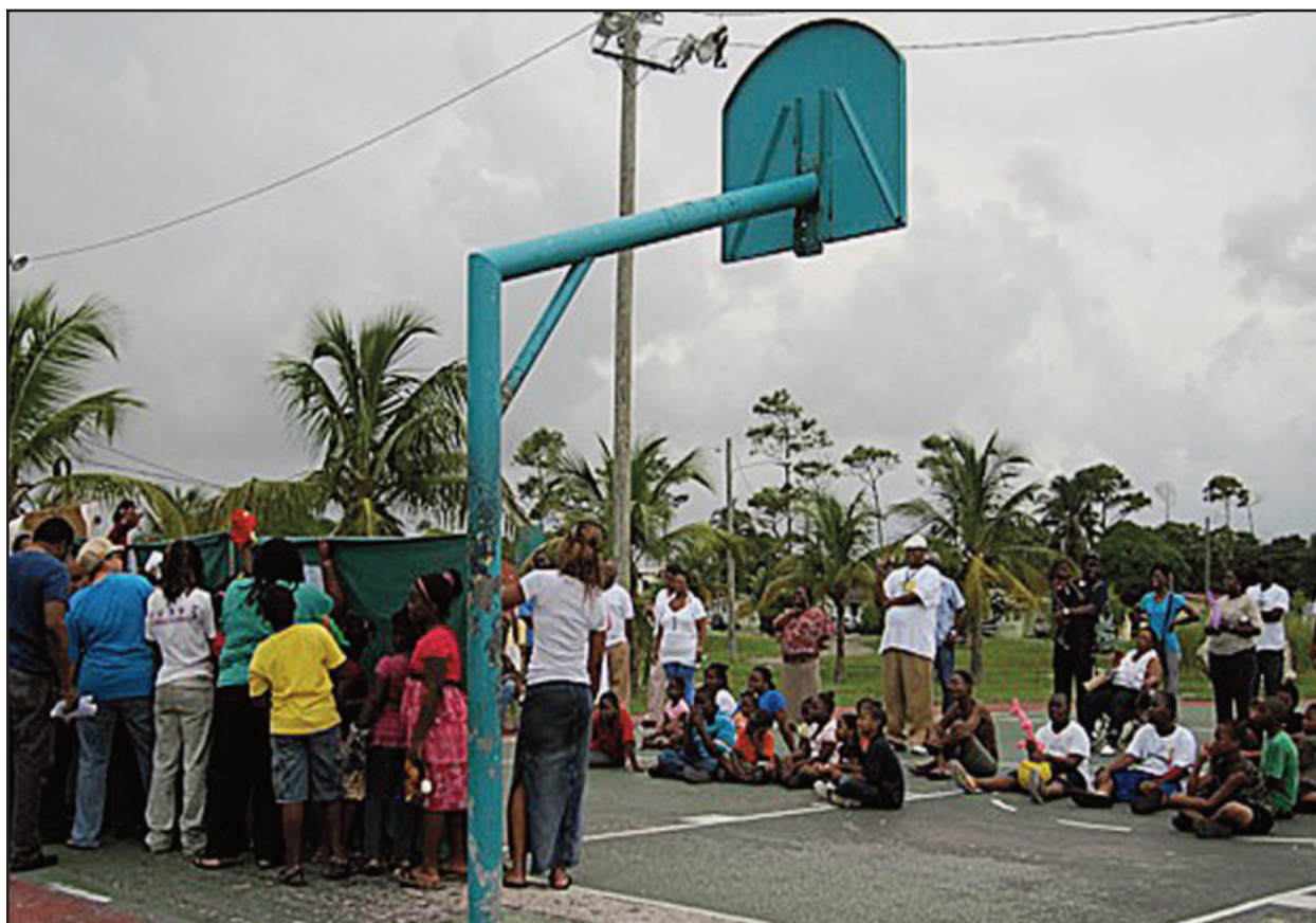
41 - OPEN AIR IN THE BAHAMAS

It has been common practice for us to travel to the US, England, Australia, Canada, Brazil, Mexico, and Germany through the years in order to attend OAC conferences. In 2012 and 2018, we were privileged to serve with our Bahamas staff. An open-air meeting (picture 41) was held using puppets, drama, and the sketchboard, in between rainstorms.