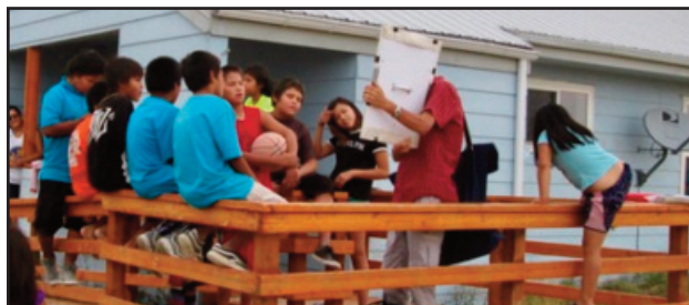
36 - USING A HANDHELD SKETCHBOARD

In 2017, my back started "going out" so I began working with a handheld sketchboard (picture 36). I have discovered that most everyone is receptive to interesting pictures illustrating the gospel. Such drawings can easily be displayed on these boards making them especially well suited for smaller meetings.