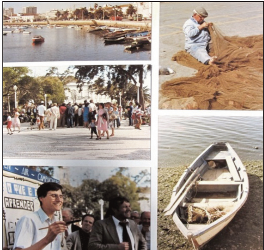
06-10 FISHING FOR MEN IN PORTUGAL

It is a blessing to be fishers of men. In Portugal (pictures 06-10), we taught in a Bible school in the north and conducted some spiritual “fishing” by reaching tourists and locals in the Algarve. In Lisbon, an AME missionary was impressed with these meetings and took us to a slum where a Youth With A Mission (YWAM) team earlier in the year claimed it was too dangerous to evangelize! But with the visual aids, lots of prayer, and God’s love, it turned out that souls were prepared, and this outreach was a very fruitful endeavor.