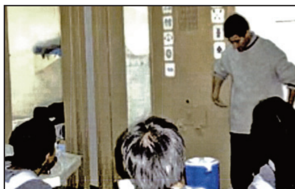
38 - A RARE PHOTO SHOWING A WORSHIP SERVICE TAKING PLACE IN PRISON

Picture 38 shows a rare scene: a photo of a worship service being held in jail. In recent years, picture taking has been banned in the prison system. Such scenes as this are no longer readily obtainable! The iron doors in the picture served well; I could put up the small Indian symbol flashcards, which had magnet strips. For many years, we trained volunteers and conducted ongoing weekly Bible studies with the Prison Fellowship team, serving all facilities in Fremont County, the jails in Ft. Washakie and in Lander, the Detox and the Honor Farm in Riverton, and the ShoRap treatment center in Ft. Washakie. In 2018, God also added opportunities to minister at the Tribal Children's Home and the Fremont County Group Homes, which provide services for teenage boys and girls.