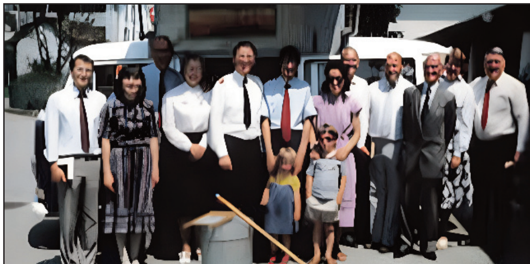
21 - BOARD MEMBERS AND VISITORS AT LAUNCH OF OAC SWITZERLAND