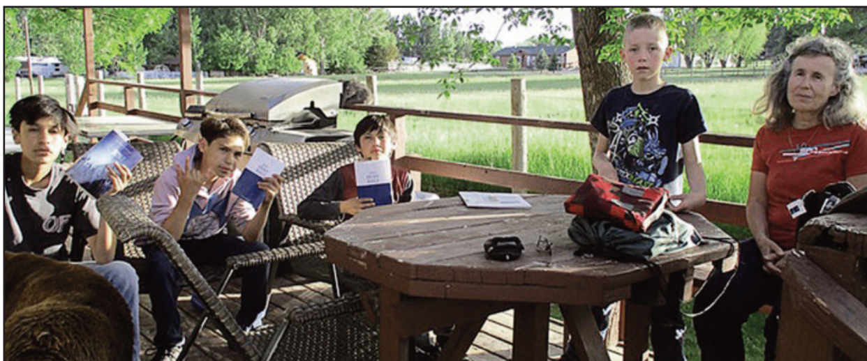
44 - BOYS' GROUP HOME, A TOUGH CROWD

44). Several times, a couple of tough teenagers challenged us verbally and with scuffles. Once they left, these four boys in the picture, including the caretaker that night, put God first by trusting Jesus as their Savior. Here, they proudly show off their own Bibles.