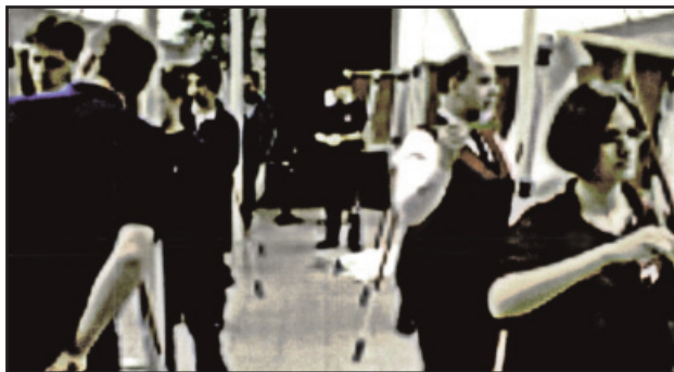
25 - TRAINING IN BIBLE SCHOOLS

Over the years, I taught principles of open-air evangelism regularly in Bible schools (picture 25) within France (France pour Christ, Alsace) and in the German and French part of Switzerland (New Life in St. Gallen and Bern; Salvation Army, Chrischona, and Bienenberg in Basel; Seeburg in Iseltwald BE, Emmaus in Vevey VD, and Le Roc in Geneva).