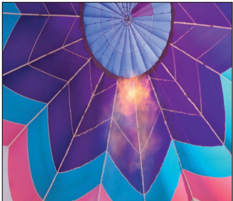
46 - OAC CAN EVEN USE A HOT AIR BALLOON TO ATTRACT A CROWD