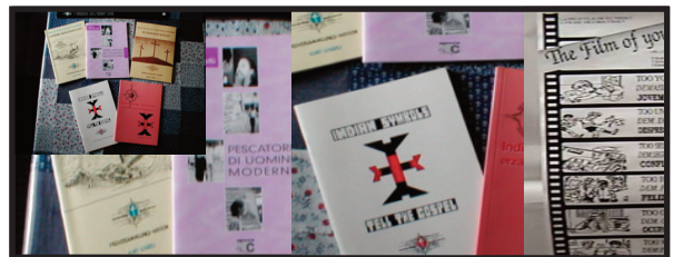
02 - TOOLS OF EVANGELISM

In the early days of our ministry, we began publishing under OAC-CH (the letters "CH" stand for "Confederation Helvetica," an international abbreviation for Switzerland). This publishing ministry was called Ephratha-Verlag, meaning "double fruitful." Pictures 02 and 03 show some of the