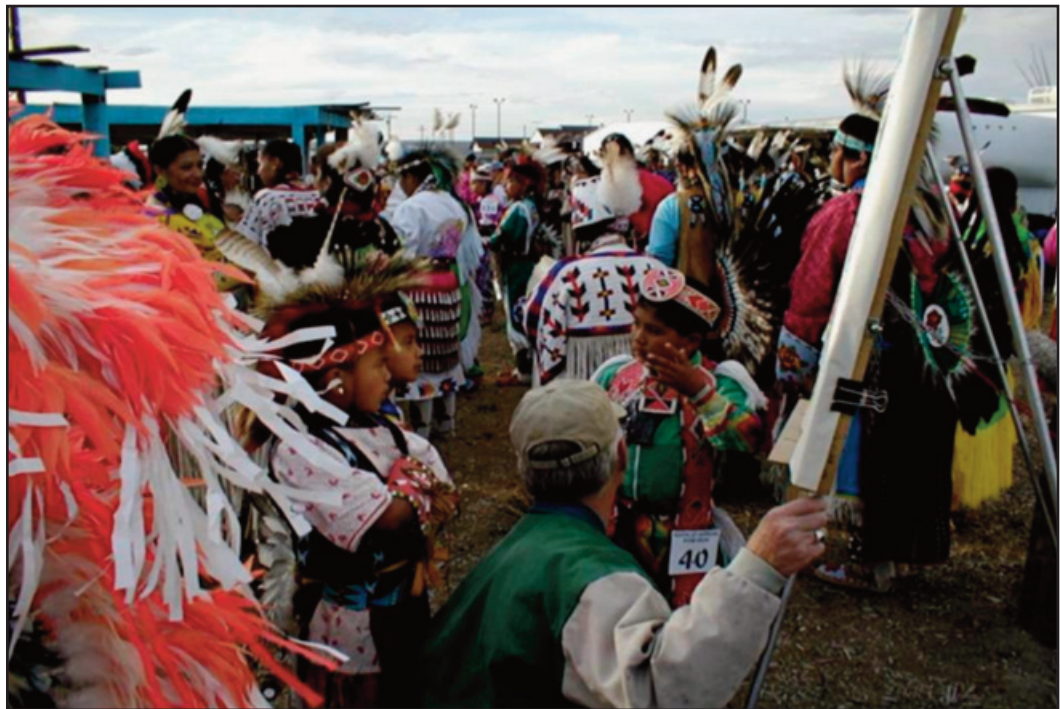
45 - SMALL BOY EXPLAINING THE SKETCHBOARD MESSAGE TO HIS PEERS