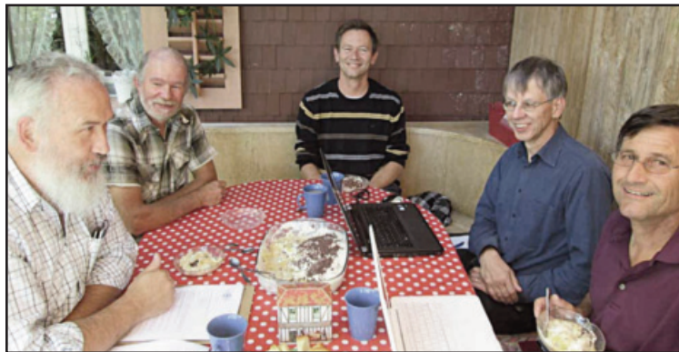
22B - SWISS BOARD MEMBERS AS OF 2019