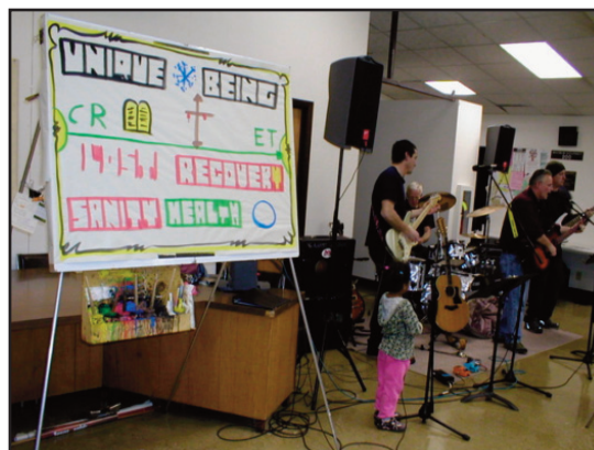
39 - GRADUATION SERVICE AT THE SET-FREE PROGRAM

I often held short devotions at the Christian Food Store House and started teaching regularly at the Set-Free program for ex-addicts and prisoners. The "Recovery Celebration," a bi-monthly event, was started by the parents of an ex-prisoner. Folks graduating from the Set-Free program, which we prayed into our area to establish a follow-up ministry for prisoners, share their stories after a short input from another leader or me. Music and a meal (picture 39) are also provided. This event is well-liked by Natives and volunteers from all over Fremont County.