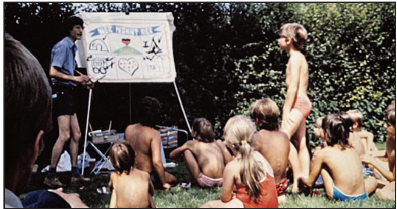
24 - MANY BEACH OPEN-AIR OUTREACHES HAVE TAKEN PLACE

We have conducted many open-air outreaches on beaches over the years (see picture 24). Some of these have taken place in the Protestant area of Schöffland and some in the Catholic area around the Sempacher Sea, both locations in the vicinity of Lucerne, Switzerland. It is incredible how often we were miraculously granted permission. We also presented Christ in creative ways at markets, carnivals, and weddings! Usually, securing official permission was needed to conduct these presentations, so we did, and enjoyed wonderful results.