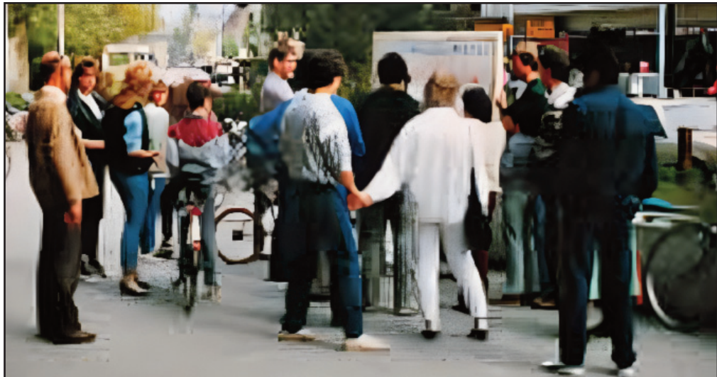
20 - A MEETING DURING THE FIRST SEMINAR IN SWITZERLAND

Picture 20 shows an open-air meeting during the first seminar held in Sursee, LU, Switzerland, most probably in the spring of 1983, in front of the MMM shopping center.