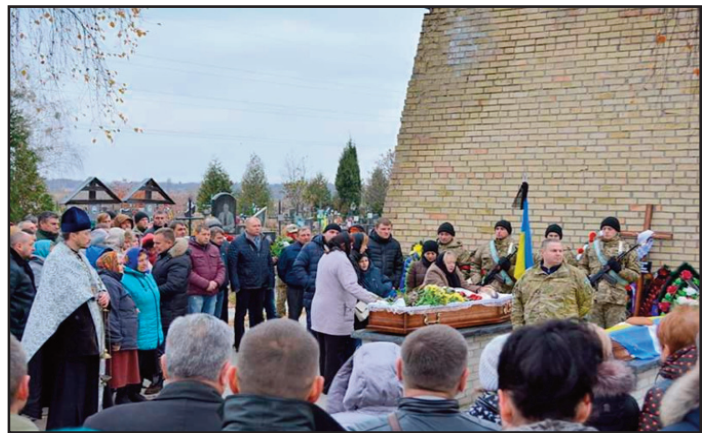
PARTICIPATING IN FUNERALS