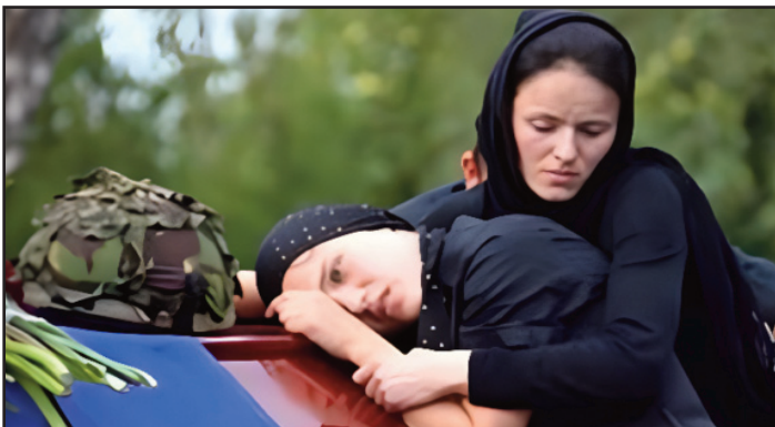
SOLDIERS KILLED AND WIDOWS MADE

Ukrainian symbol of death) with pictures attached to the trees of people who were taken there and shot under Stalin's reign of terror. For the first time, I understood how much the Ukrainian people have suffered over many generations. Later, I would go to the Chernobyl area for evangelism and saw the devastation caused by atomic radiation. Many Christians also died under communism, and in church after church, I was told of pastors who had been taken to Siberia and never seen again.