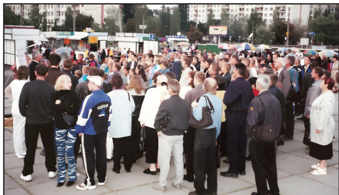
ONE OF THE FIRST OPEN-AIR MEETINGS IN KIEV