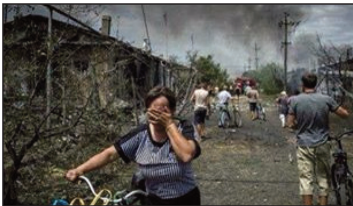
WAR BETWEEN RUSSIA AND UKRAINE