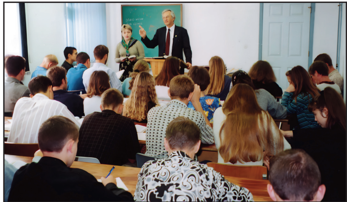
KIEV CHRISTIAN UNIVERSITY SEMINAR

In 1999, I arrived in Kiev and was met by some of the KCU staff. They took me on a tour that I shall never forget. As we went through the World War II museum, we saw hundreds of photos of the eight million Ukrainians who had been killed in various ways. Our translator wept. Then, we went to a Jewish memorial that showed hundreds of families being mowed down by Nazi machine guns, as the parents tried to shield their children with their bodies. In the forest, we were shown black crosses made like crows (a