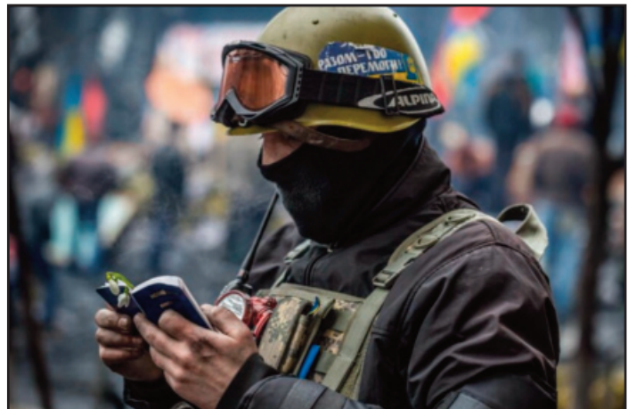
SOLDIER FACING DEATH READING SCRIPTURE