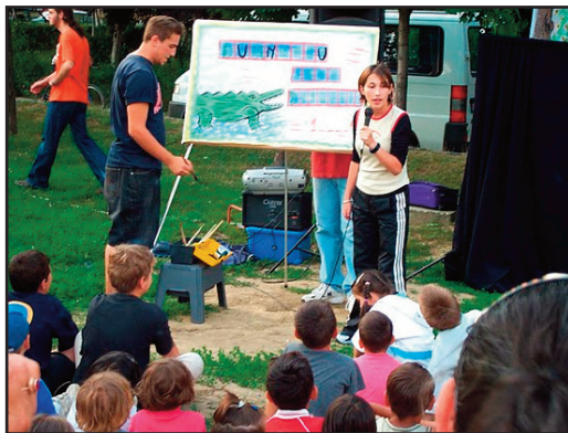
NEWLY TRAINED STUDENTS PRESENTING A MEMORY VERSE ON THE SKETCHBOARD