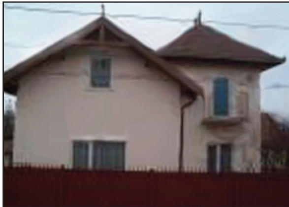
OUR OAC ROMANIA OFFICE IN ALBA IULIA, ROMANIA

The vision of our work in Romania is to train Romanians to reach their homeland for Christ so that they can "Present Christ By All Means Everywhere."