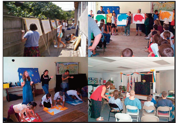
GOD ENABLES US TO DO LOTS OF GREAT TRAINING