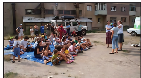
ONE OF THE FIRST CHILDREN'S OPEN-AIRS IN ALBA IULIA, THIS LED TO A WEEKLY KIDS' CLUB WHICH HAS BEEN RUNNING FOR THE PAST 17 YEARS

"The main office of OAC Romania is located in Alba Iulia, and the work is now officially registered in this country as "Organisatia Crestina in Actiune" which in English means "Christian Organization in Action." There is also work going on in Vatra Dornei, a potential site that, Lord willing, could operate as a