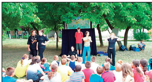
DRAMA TEAM AT AN OPEN-AIR MEETING FOR CHILDREN IN TIMISOARA

"However, over a period of time through Bible study and listening to sermons, God began to speak to me about actually getting involved in ministry, and I can remember saying to Him at the time, 'I can't do it; I don't know what to do.' But the Lord said, 'Trust Me – do what you did before.' He meant the puppets were the key, and I became the church puppet team leader, as well as a full-time staff evangelist with OAC.