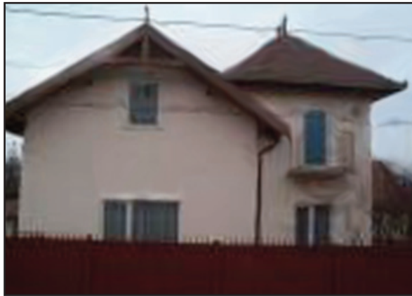
OUR OAC ROMANIA OFFICE IN ALBA IULIA, ROMANIA

The vision of our work in Romania is to train Romanians to reach their homeland for Christ so that they can "Present Christ By All Means Everywhere."