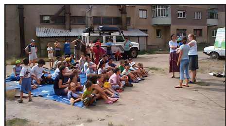
ONE OF THE FIRST CHILDREN'S OPEN AIRS IN ALBA IULIA, THIS LED TO A WEEKLY KIDS' CLUB WHICH HAS BEEN RUNNING FOR THE PAST 17 YEARS

The main office of OAC Romania is located in Alba Iulia, and the work is now officially registered in this country as "Organisatia Crestina in Actiune," which in English means "Christian Organization in Action." There is also work going on in Vatra Dornei, a potential site that, Lord willing, could operate as a