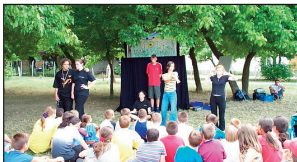
DRAMA TEAM AT AN OPEN-AIR MEETING FOR CHILDREN IN TIMISOARA

"However, over a period of time through Bible study and listening to sermons, God began to speak to me about actually getting involved in ministry, and I can remember saying to Him at the time, 'I can't do it; I don't know what to do.' But the Lord said, 'Trust Me – do what you did before.' He meant the puppets were the key, and I became the church puppet team leader, as well as a full-time staff evangelist with OAC.