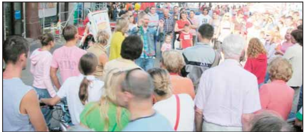
STUART USING A ROPE ILLUSTRATION