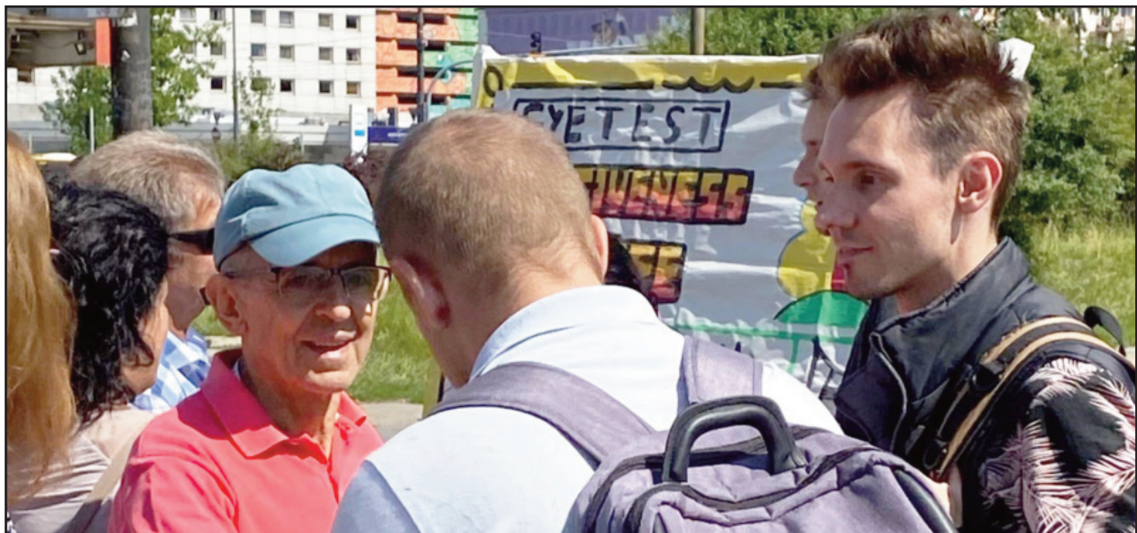
CONVERSATIONS TAKING PLACE AFTER A SKETCHBOARD PRESENTATION IN WARSAW