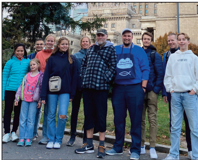
MISSION TRIP 2023