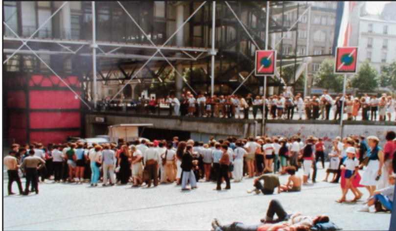
27 - OPEN-AIR IN PARIS

no way to contact him or any of the team members! So, Shoshanah and I prayed for God to guide us. We were driving along and didn't need gas, yet God prompted us to stop at a gas station about 30 miles outside of Milano. When we stopped at the station and asked for directions, there was a Volvo with GB license plates gassing up - it was Korky!!! GPS at that time stood for "God's Positioning System," and God certainly took care of the details, as this story illustrates!