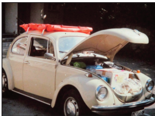
11 - A MINISTRY "BEETLE"