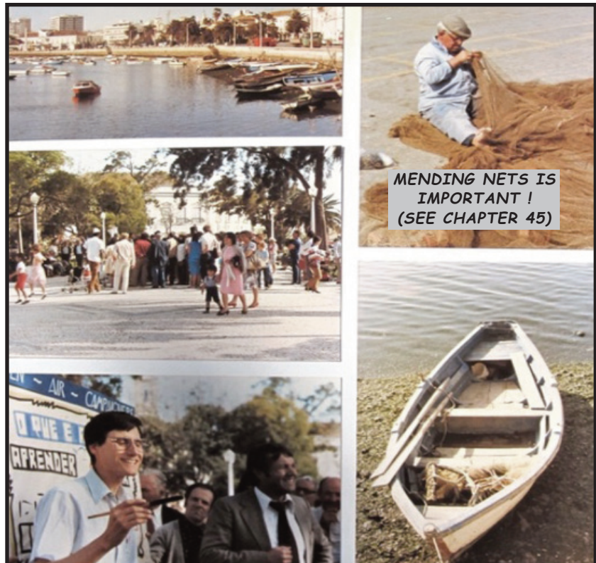
06-10 FISHING FOR MEN IN PORTUGAL

It is a blessing to be fishers of men. In Portugal (pictures 06-10), we taught in a Bible school in the north and conducted some spiritual “fishing” by reaching tourists and locals in the Algarve. In Lisbon, an AME missionary was impressed with these meetings and took us to a slum where a Youth With A Mission (YWAM) team earlier in the year claimed it was too dangerous to evangelize! But with the visual aids, lots of prayer, and God’s love, it turned out that souls were prepared, and this outreach was a very fruitful endeavor.