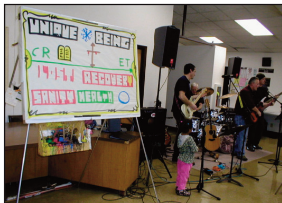
39 - GRADUATION SERVICE AT THE SET-FREE PROGRAM

often held short devotions at the Christian Food Store House and started teaching regularly at the Set-Free program for ex-addicts and prisoners. The "Recovery Celebration," a bi-monthly event, was started by the parents of an ex-prisoner. Folks graduating from the Set-Free program, which we prayed into our area to establish a follow-up ministry for prisoners, share their stories after a short input from another leader or me. Music and a meal (picture 39) are also provided. This event is well-liked by Natives and volunteers from all over Fremont County.