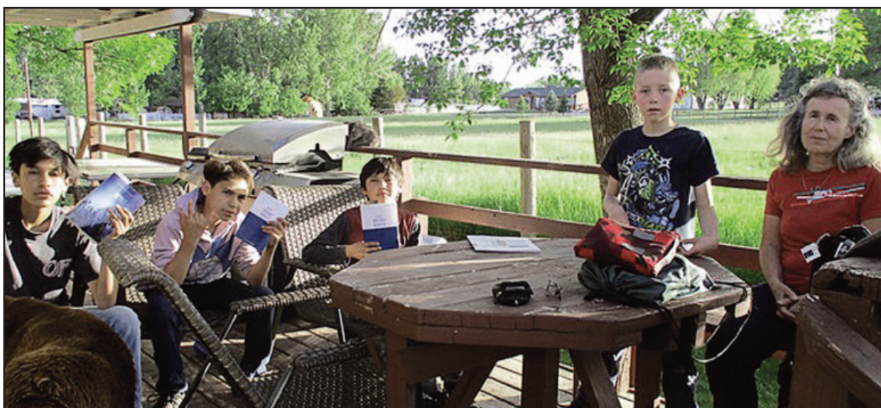
44 - BOYS' GROUP HOME, A TOUGH CROWD

44). Several times, a couple of tough teenagers challenged us verbally and with scuffles. Once they left, these four boys in the picture, including the caretaker that night, put God first by trusting Jesus as their Savior. Here, they proudly show off their own Bibles.