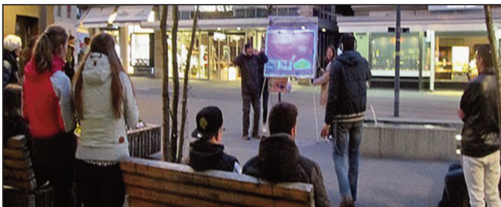
42 - OPEN-AIR MEEING AT INTERLAKEN USING SEMINARY STUDENTS TO HELP US

Picture 42 shows an open-air meeting in 2019 at Interlaken with Seminary Biblical Theology students. An "international" tourist is filming the action. We are showing students "the ropes" (picture 43) and how to teach with visual aids.