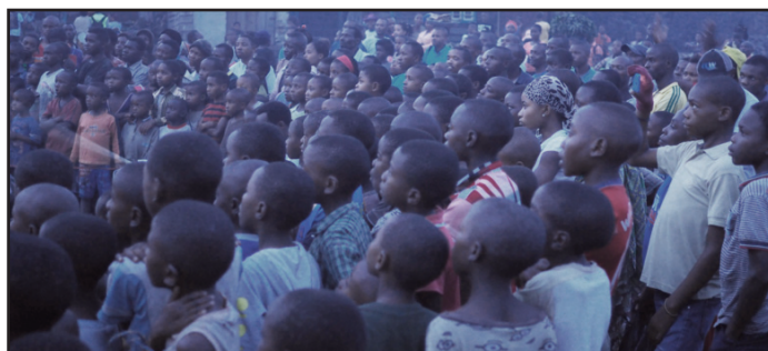
IMMORTAL SOULS CHOOSING WHAT THEY WILL DO WITH JESUS

Goma. The rain was threatening, but even as we put up the film equipment, people were gathering. About 400 stood for 90 minutes to watch The Jesus Film and hear the gospel message preached with Fred translating. When many responded to put their trust in Christ as Savior, there was applause. There was no opposition or anti-foreign reaction. We were presenting Christ as the only answer for our present lives and our eternal souls, with no political or tribal agenda. The same happened at the following meetings, with up to 600 attending. In one village, people even stood in light rain to watch. We had to use iron stakes and a rope to keep the crowd from pressing forward on top of our video projector and us. After many responded to trust Christ as Savior, people cheered and shouted as I have never seen before. Usually, we had a local pastor with us for follow-up. The man who warned us not to go, after hearing what God was doing, begged me to take him to our next film meetings! Fred now continues to hold open-air meetings using the film and sketchboard messages, with crowds of all ages up to 1,000 people.