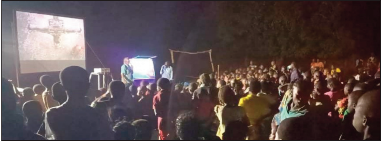
OVER 1000 PEOPLE WATCH THE JESUS FILM AND HEAR THE GOSPEL PREACHED (FRED TRANSLATING)