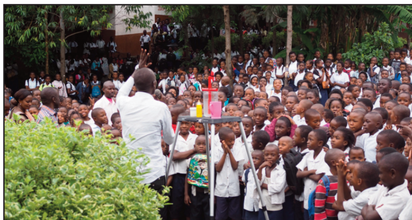
FOLLOWING THE MESSAGE, THE CHEMICAL CROSS ILLUSTRATES THE WAY OF SALVATION TO STUDENTS IN PUBLIC SCHOOLS

Although electricity and water were rarely available, this actually helped our ministry. Most people did not have a TV, so they gladly came to see our film. One Christian