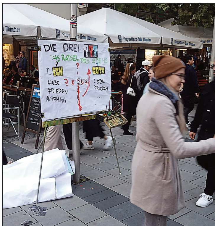
USING THE SKETCHBOARD IN MUNICH, GERMANY