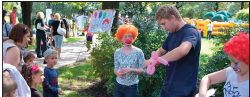
MARTINS BUSMEISTERS AND VOLUNTEERS USING BALLOONS TO ILLUSTRATE SPIRITUAL TRUTH