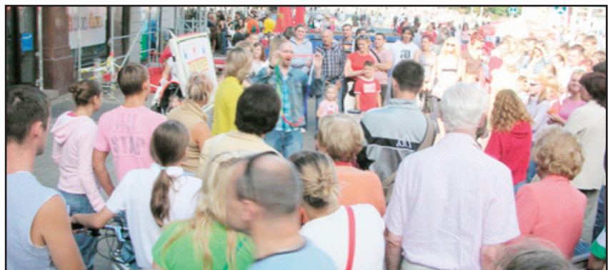
STUART USING A ROPE ILLUSTRATION