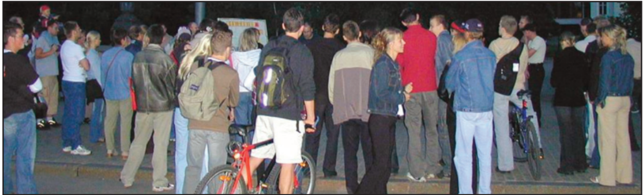
OPEN-AIR MEETING IN RIGA LED BY POUL NIELSEN