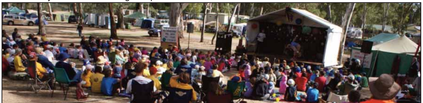
OPEN-AIR MEETINGS FOR EVERYONE

Looking ahead, we are trusting God for our future and are confident He will guide and provide as He has faithfully done since raising us up in 1892.