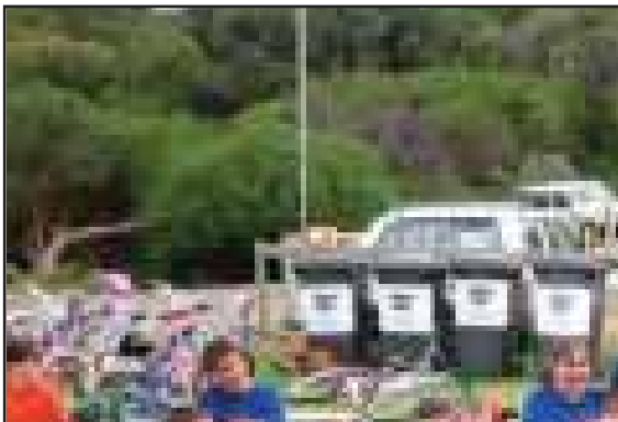
SUMMER BEACH STYLE OUTREACH